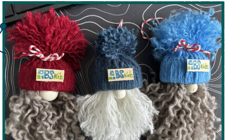
TN is feeling festive with these cute ABSKids gnome ornaments!!