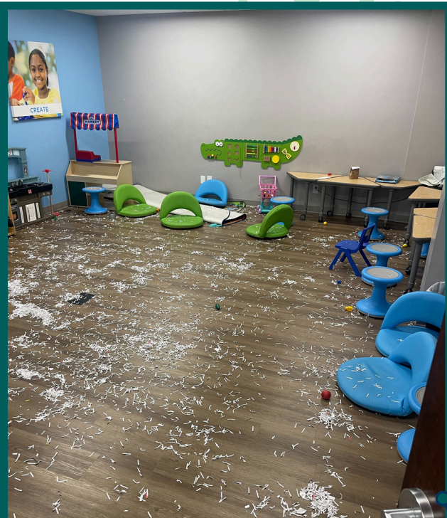
Snow Party at our Charlotte Billingsley Center