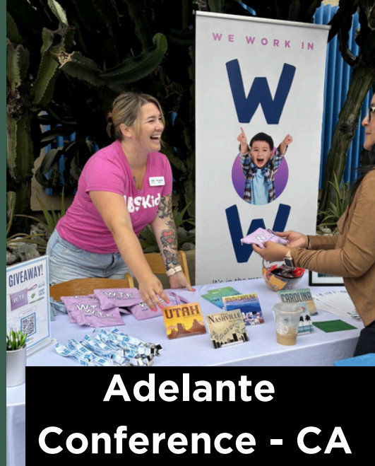
Adelante Conference - CA