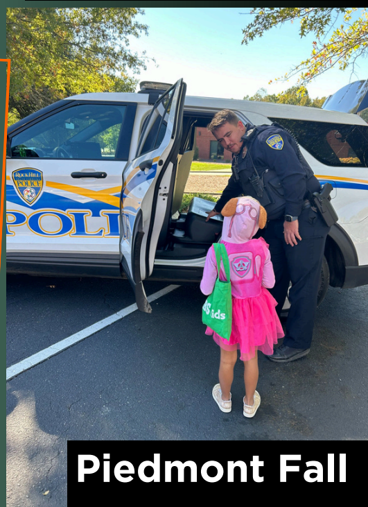
Piedmont Fall Festival - SC

Thank you to our incredible events team and center staff for bringing the Halloween spirit to life! 🎃👻 Your creativity and hard work made the celebrations unforgettable for our families. We appreciate all that you do!