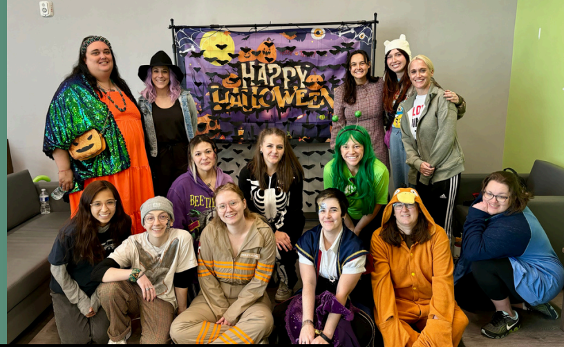
Daybreak Halloween Bash - South Jordan, UT