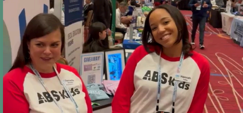
Autism NJ Conference