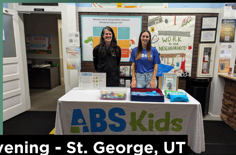
Sensory-Friendly Evening - St. George, UT