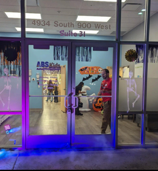
Trunk O Treat - Riverdale, UT