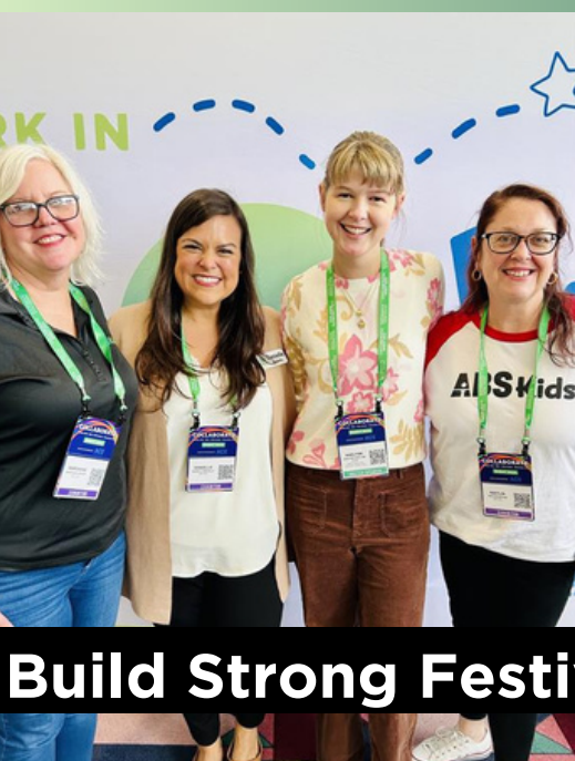
Build Strong Festival - NC